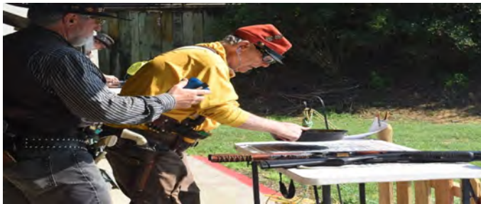
Rodent getting ready to drop the pan. The sun was hot and so was the danged pan!

Our clean shooters for the match were Old Doc Potter and Slow Gin Ricky.