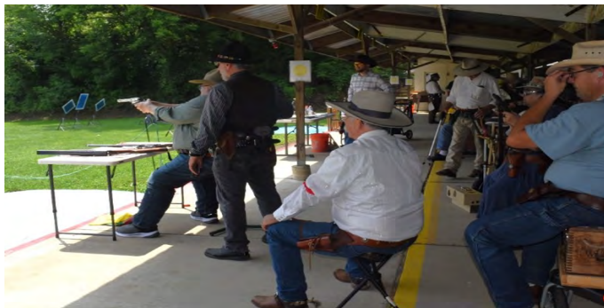
Honest Abe, Keeping the stage honest.